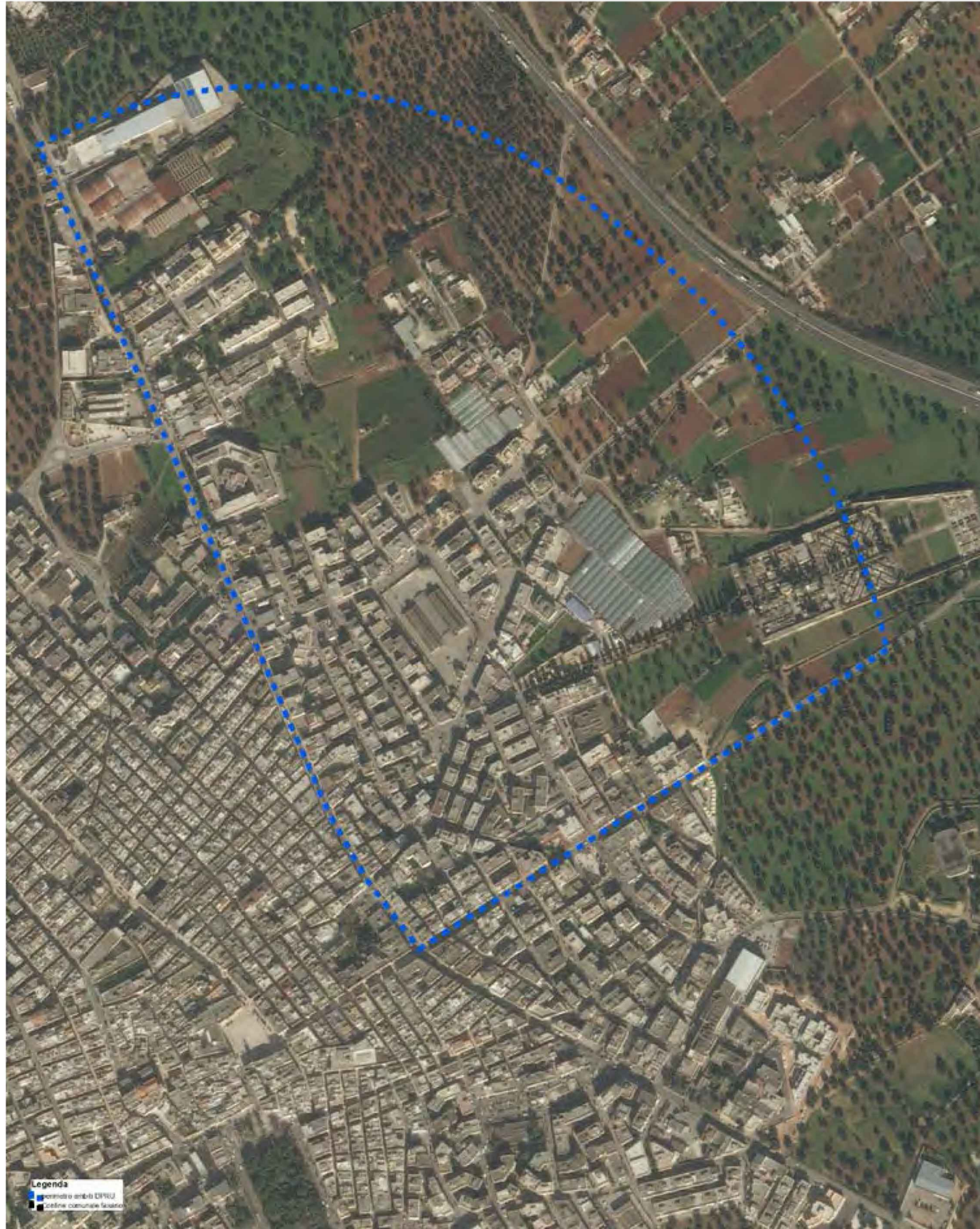
Inquadramento su Ortofoto - scala 1:6.000